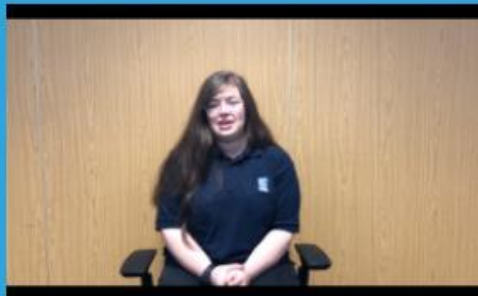
ALICE Rolls Royce