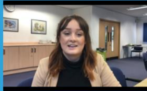
ABBY Opus People Solutions