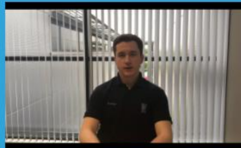
ANDY Rolls Royce